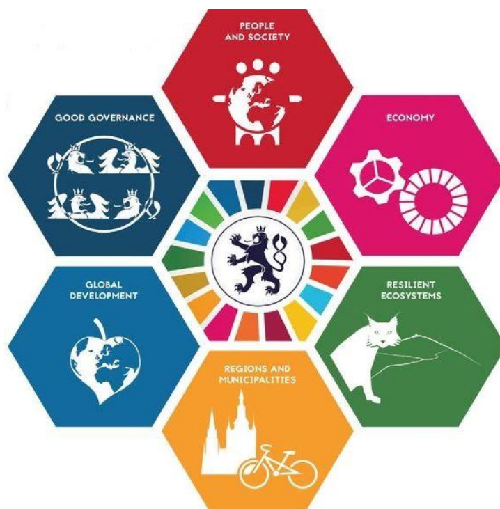
Pic. 2: Main fields of Strategy framework the Czech Republic 2030.

These objectives are also reflected in the measures in this Strategy. (CR2030, 2017)