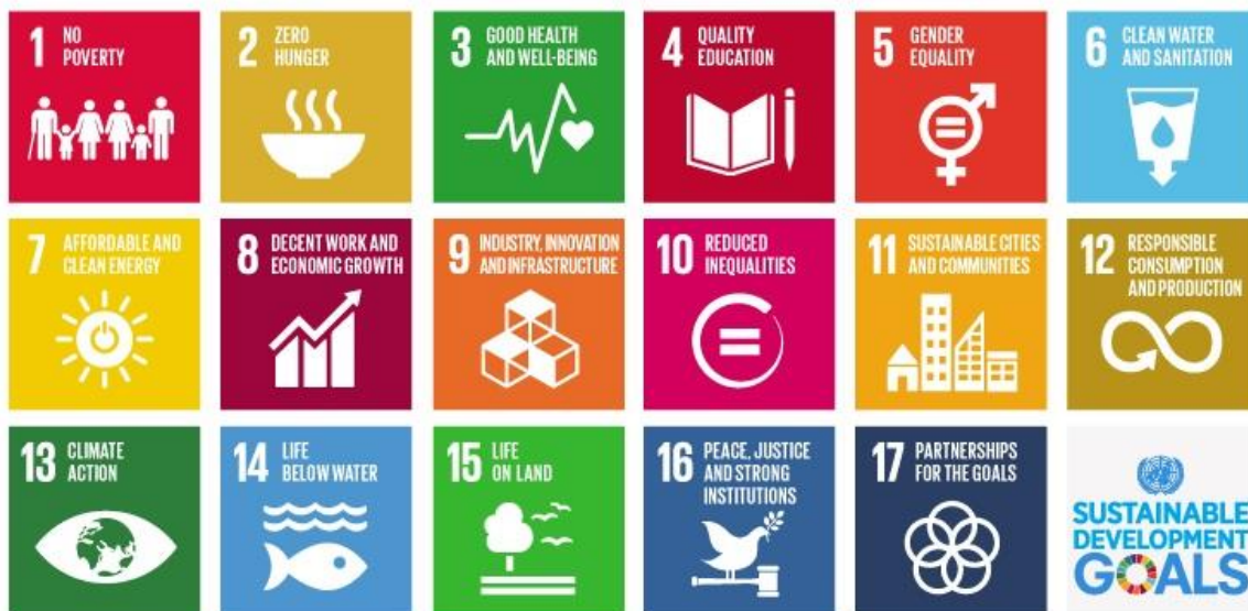
Pic. 1: Goals of SDGs finally adopted by UN summit that took place on the 25 th of September 2015 in New York.