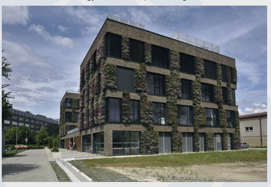
Science and Technology Park Envelopa Hub – green facade

Retention tanks for rainwater harvesting are gradually being introduced at UP. The first retention tank was installed in the building of the Faculty of Arts on Křížkovského Street in 2017. The Faculty of Science has a retention tank in the Botanical Garden building and other tanks are going to be installed on the Envelopa campus on 17. Listopadu Street in 2024. The new Science and Technology Park Envelopa Hub building also has a retention tank that accumulates all rainwater from the surface of the building and the adjacent parking lot. This water is then used to irrigate the green facade of the building. The Faculty of Law also has one retention tank. Another retention tank is being built as part of the construction of the new UP Archive on tř. Míru Street, where drainage is planned through a single rain sewer. Rainwater from the roof of the building and the car park will be discharged into a retention tank with a regulated outflow, which is also connected to a collecting shaft, to which sewage from the building will also be discharged. Last but not least, there are also plans to build parking spaces from grass block pavers, which thanks to their permeability, reduce water run-off.